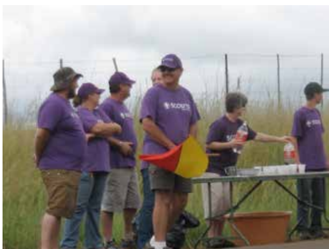
Waiting for the last runner to pass.